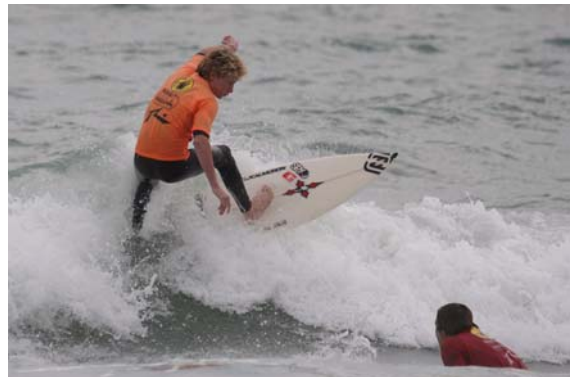
Local talent showing how to work a small wave

Our first contest, held on November 26, 2005 turned out to be a great success. Surfers turned out for all categories, although conditions were small, competition was strong. The second competition, set for February 4, 2006 is under way. (*Pics from 1 st contest available at Innerlight 9 th Ave)